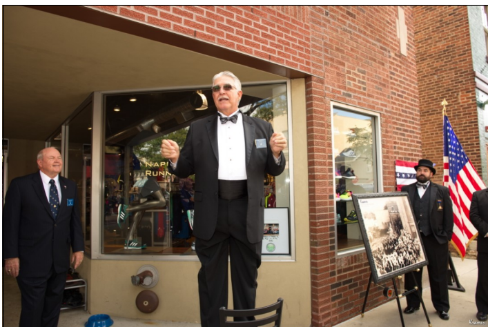
Wbro. Dry addressing the attendees