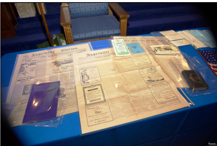
Time Capsule contents displayed