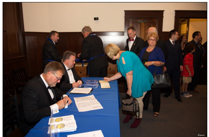
Attendees signing the guest book and receiving their gift coupons