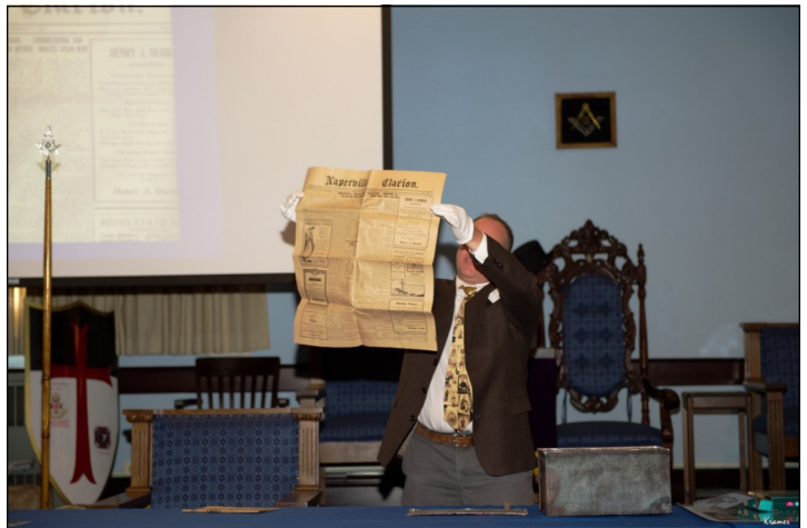
1916 Naperville Clarion Newspaper