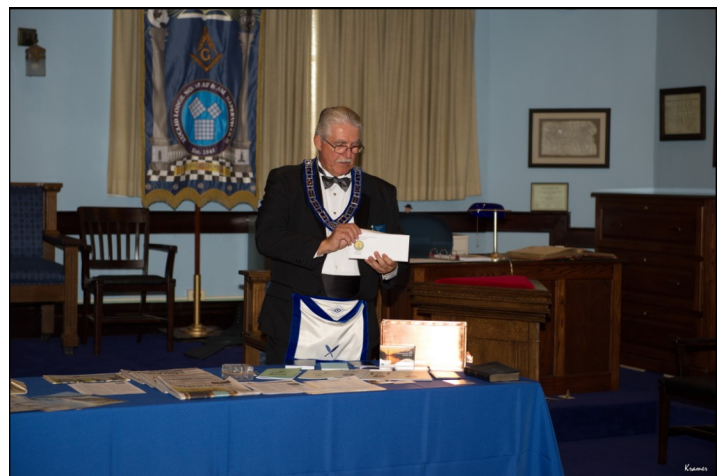
New Time Capsule and contents on display